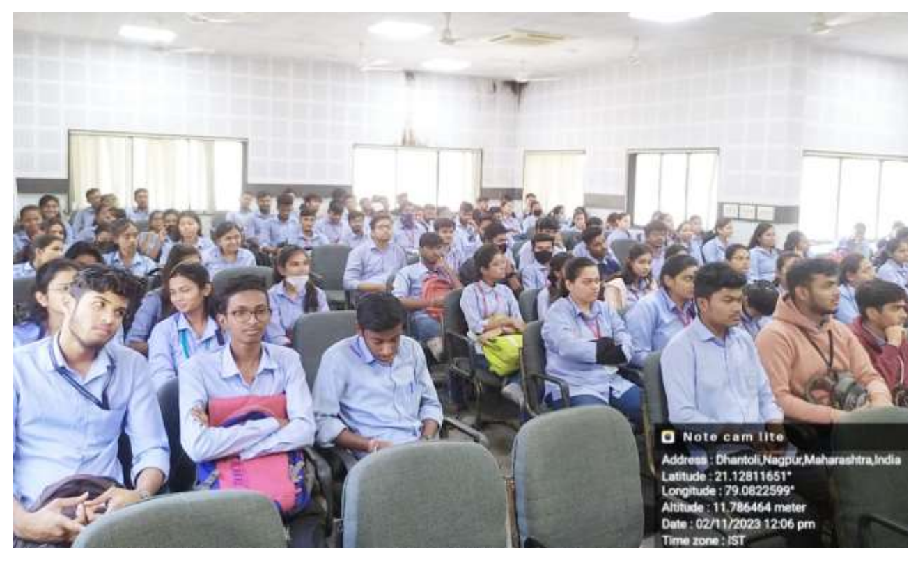
Students during the Workshop.